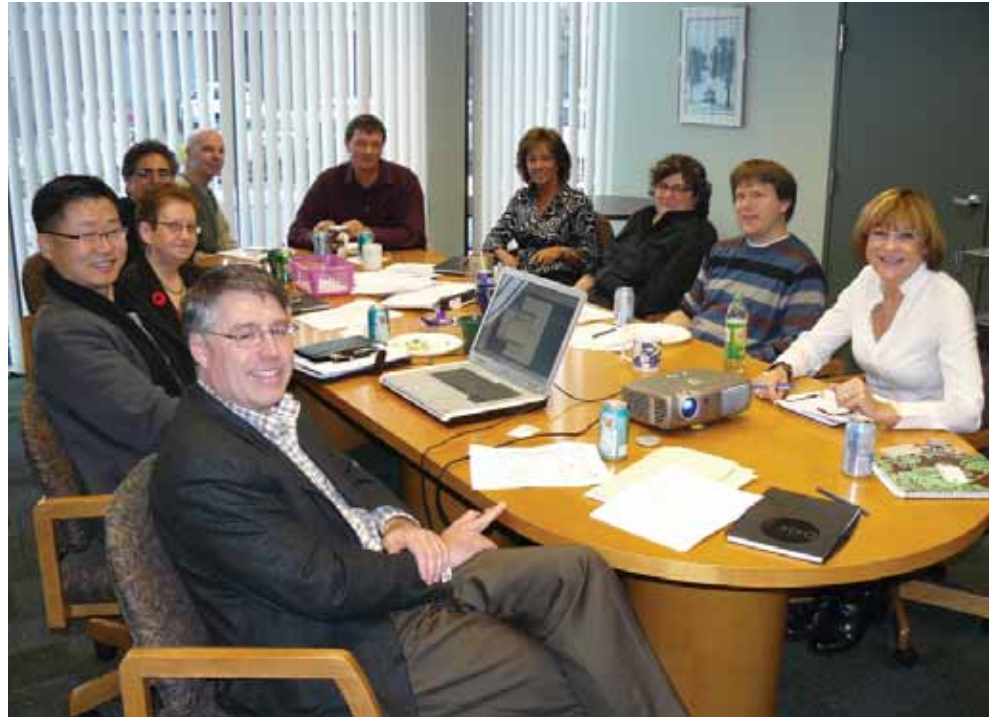
The JDQ team joins the DDA team.

Remember the Developmental Disabilities Foundation in your will. For more information about how to make a legacy gift please call 604-233-5487 or email sstreet@develop.bc.ca